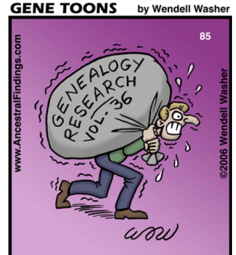
Genealogy - Taking in the trash.